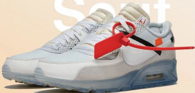
NIKE / AIR MAX 90 / OFF-WHITE X AIR MAX 90 'THE TEN'