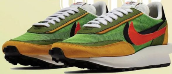
NIKE / LD WAFFLE / SACAI X LD WAFFLE 'GREEN GUSTO'