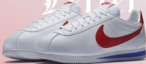
NIKE / CORTAZ / CORTAZ BASIC LEATHER ON 'FORREST GRIP'